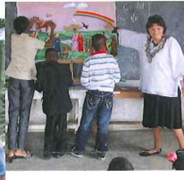
Gil Harder Academy