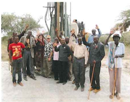
Children's Church New Well Living Waters