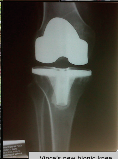
Vince's new bionic knee