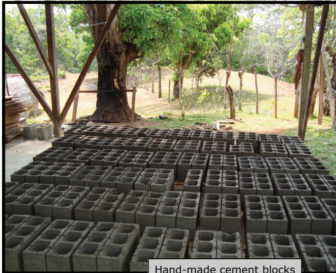
Hand-made cement blocks

While the boat is being fixed, we decided this would be a perfect time to do some additional long-needed repair work to improve my personal transportation. An accident in 1982 left my right knee severely damaged. 4 surgeries over the next 29 years extended the life of my knee, but the resulting arthritis finally brought its usefulness to a grinding painful end. The left knee was also damaged from years of overcompensation. So during the last month, I had surgery on both knees. First, the left knee and then 3 weeks later, a total joint replacement on the right. I'm doing daily physical therapy and gaining more mobility every day. Lord willing, by the time the boat is completely repaired, both my knees will be jungle-ready.