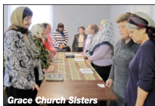
Grace Church Sisters

The Saransk weeks were filled with meetings with dear friends and their families, prayer groups, invalids,